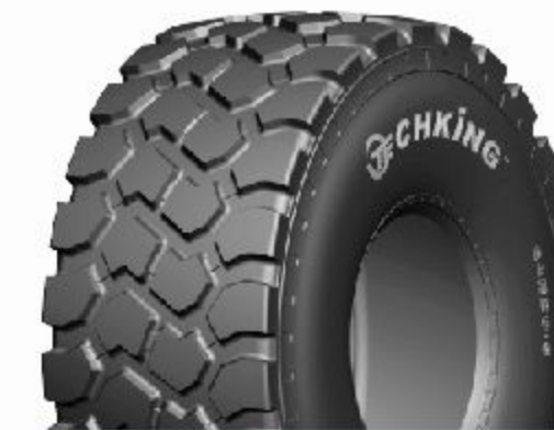
NEW DRAGON KING22™