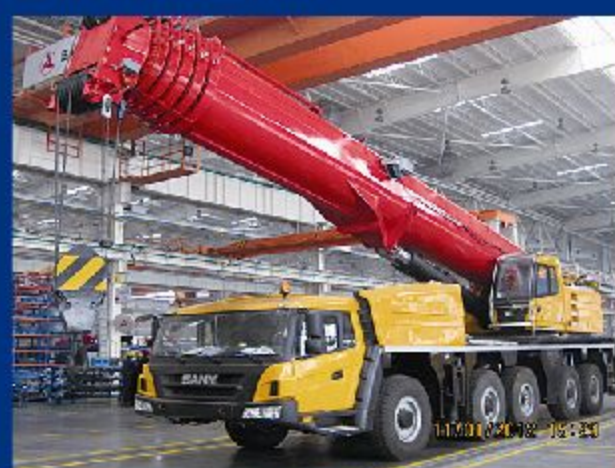
Techking 16.00R25 ETGC E2 Tire with SANY All Terrain Crane