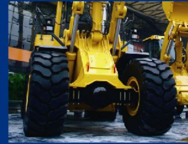
Techking 35/65R33 ETD2 L5 Tire with XCMG Loader