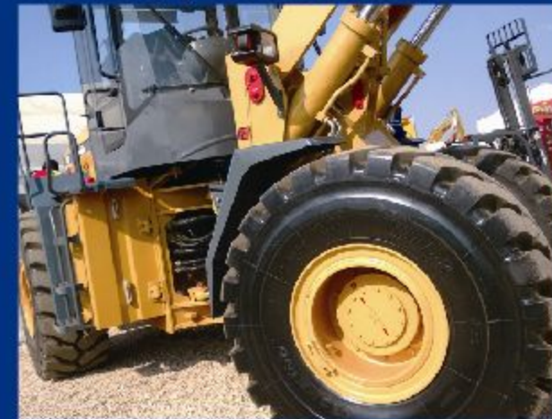
Techking 23.5R25 ETD2 L5 Tire with Lonking Loader