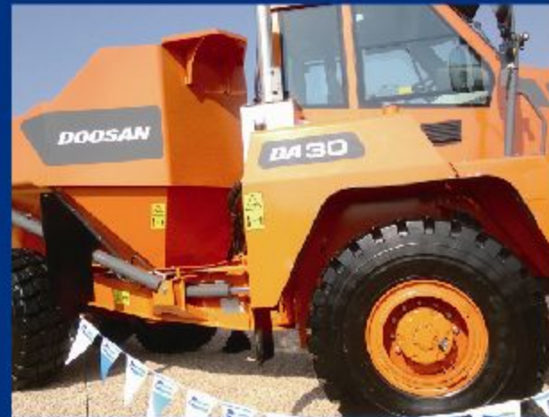
Techking 23.5R25 ETLT E3 Tire with Doosan ADT