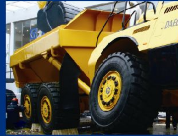
Techking 875/65R29 ETADT Super E3 Tire with L5 Tire with XCMG ADT