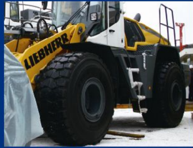
Techking 26.5R25 ET6A E3/L3 Tire with 'L' Brand Loader