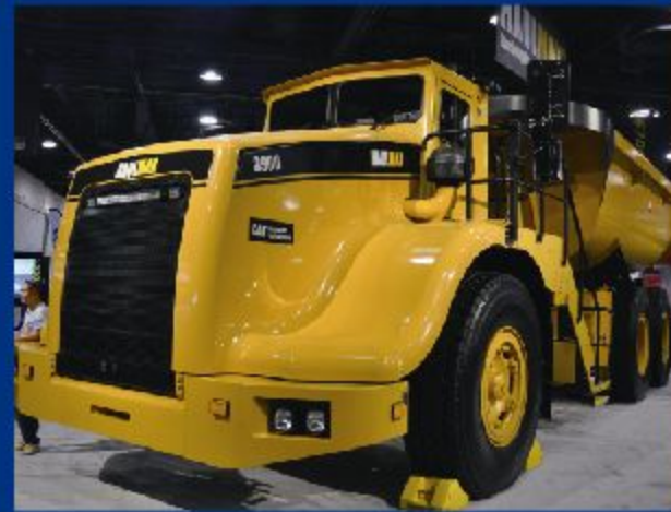
Techking 21.00R35 ETHM E2 Tire with Haulmax Truck