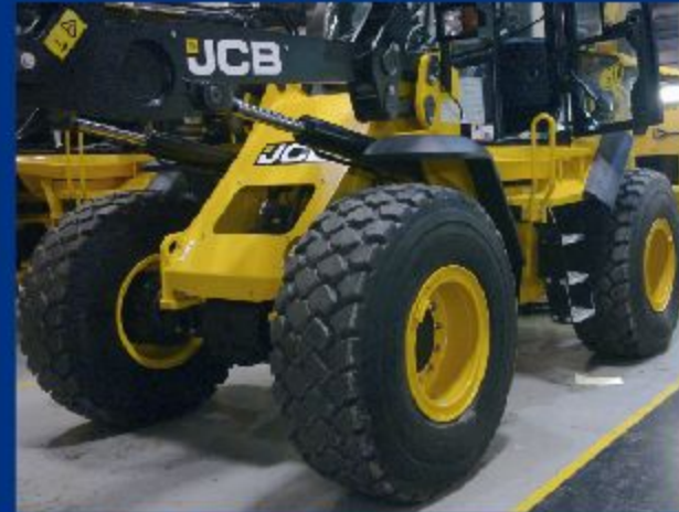
Techking 20.5R25 ET5A L3 Tire with JCB Loader