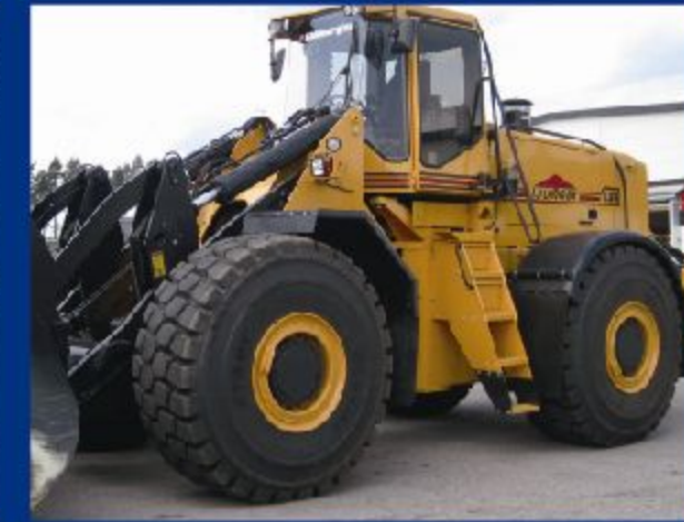
Techking 26.5R25 ETADT E4 Tire with Ljungby Maskin Loader