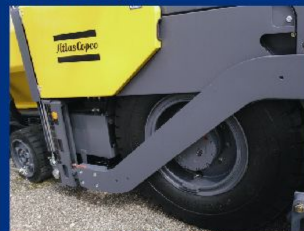
Techking 445/80R25 ETGC E2 Tire with Atlas Copco Paver