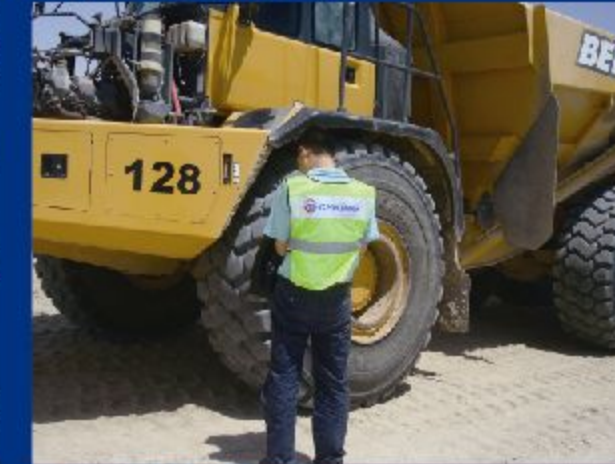
Techking 29.5R25 ET6A E3/L3 Tire with Bell ADT