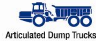
Articulated Dump Trucks

The ETADT pattern provides great traction and flotation, operation comfort and less vehicle damage.