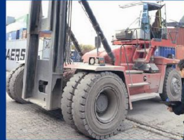
Techking 14.00R24 ETPORTM Kalmar Empty Container Handler