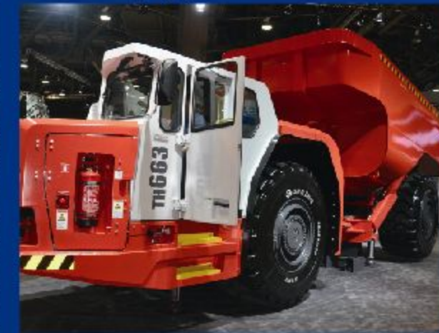
Techking 35/65R33 ETNT E4 Tire with Sandvik Underground Truck