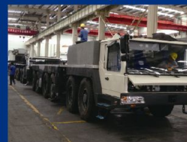
Techking 14.00R25 ETGC E2 Tire with Zoomlion All Terrain Crane