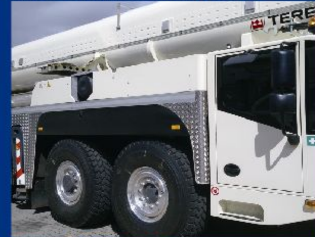
Techking 20.5R25 ETGC E2 Tire with Terex Mobile Crane